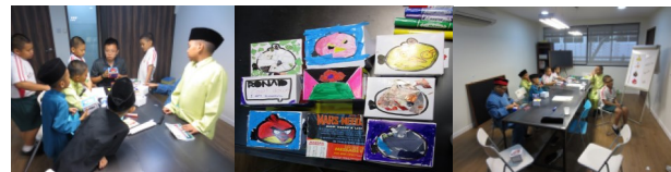
(L-R): Facilitators appreciating children's artwork , children's calm nest, class in-session