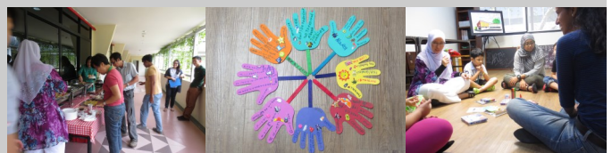
(L-R): participants enjoying lunch, children's craft & children session

The events received very positive feedback where both SAFE clients and their spouses indicated they value the mutual sharing and support through such events.