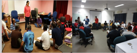
(L-R): Elated FIRE graduates at Highpoint , A session with Ashram residents

With the positive response of past participants, WE CARE will continue to bring this programme to more residents in halfway houses in 2015.