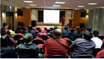
Singapore Customs employees listening to the talk.