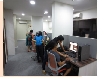
NIE trainees providing personal IT coaching

A group of NIE volunteers run a series of basic computer classes for our drop-in members. Every Wednesday from 7.15pm, our drop-ins are able to learn skills like using MS word or setting up an email account. The facilitators pay personal attention to each participant answering any related queries. Thanks to our NIE volunteers, our recovering folks have taken their first step in this IT-savvy age.